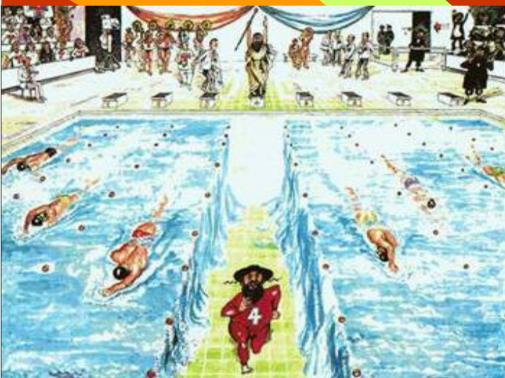
Jewish Olympic Swimmer